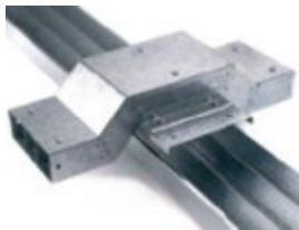
O/S CO Off set Crossover D/D CO Full depth Crossover