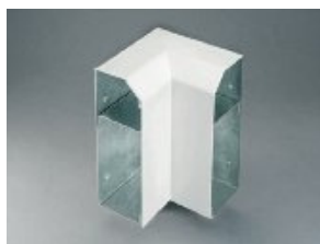
ISB Internal Bend