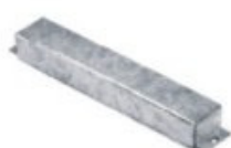
EC End cap