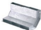
ISB Riser bend