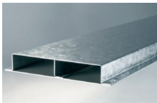
E2/61 2 Compartment Size 150mm x 25mm

Flytec underfloor trunking is designed for placing on the constructional concrete slab, to be completely covered when the final floor screed is laid and the service outlet positions fixed.