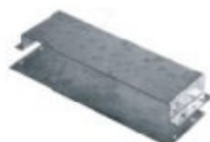
CONN Connector plate