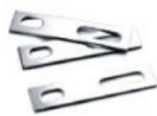
ES99 Earth link