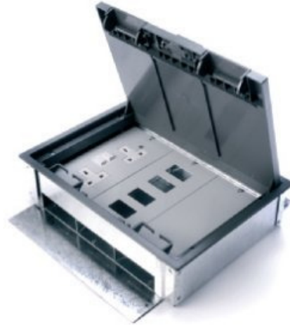
E3/SB/1TS 3 compartment service box