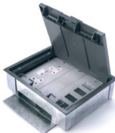
E2//SB//1TS 2 compartment service box